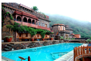
Neemrana Fort Palace